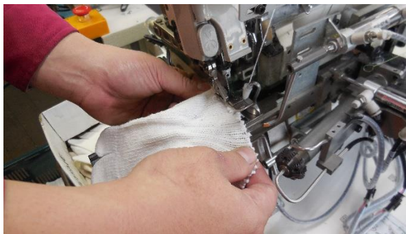
3. The Automatic Thread Trimmer by Air