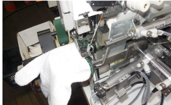
4. Automatic, Stacker